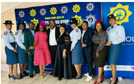
Some Members of the District Clergy pictured with Female Police Officers during the Peacebuilding and Community Engagement