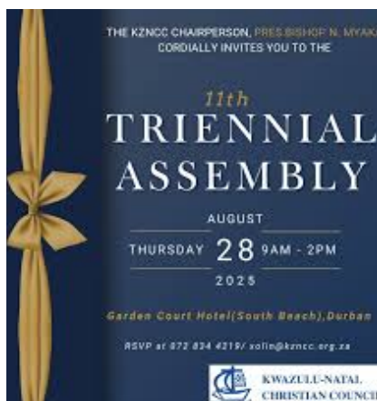
A glimpse of the exclusive digital invitation shared with distinguished attendees