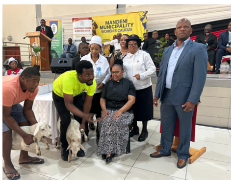
Inserts:- Publications from iLanga Newspaper (1-3 September 2025)