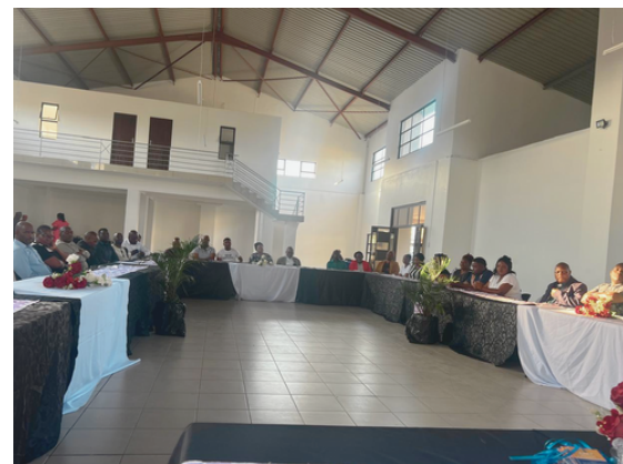
Pic 1-2: Interdenominational Women in Leadership Workshop