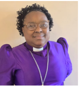
uGu Archbishop Lungisile Cele