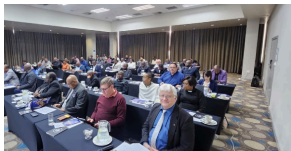
Pictured (left to right):- KZNCC Members during the 2025 AGM