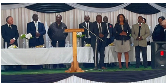
UDCC initiated a Matric Awards ceremony and Prayer in partnership with the District Department of Education