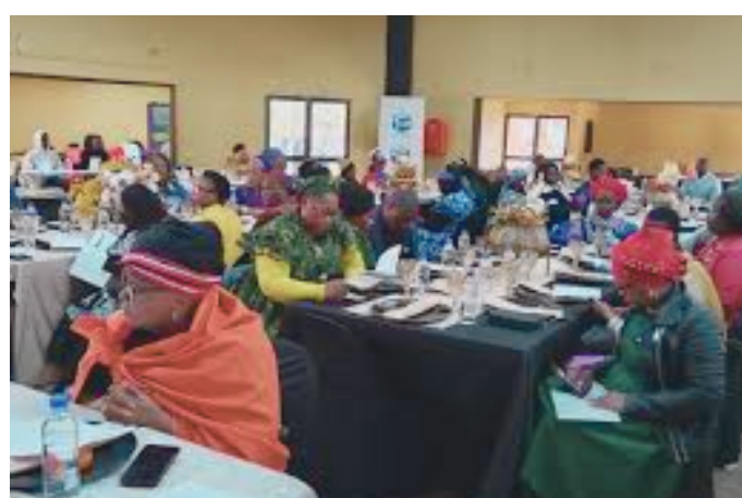
Women's Empowerment Programme at the Evangelical Church