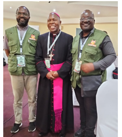
International Observers in Malawi during the 2025 General Elections

This prestigious appointment highlights Bishop Buthelezi's growing influence and commitment to promoting democracy, transparency, and good governance across the continent. The KZNCC family celebrates this milestone as a proud moment for both the Church and the province, demonstrating the vital role of faith leaders in safeguarding justice and ethical leadership beyond South Africa's borders.