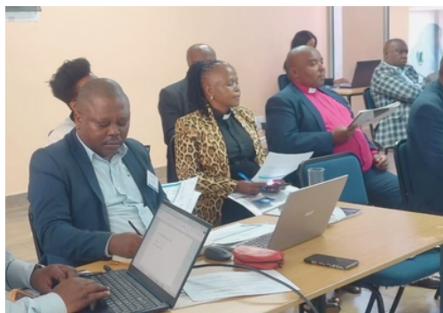
Pic 2:- Food Security Project Implementation at Bishopstowe Farm: A KZNCC Partnership with the Methodist Church of Southern Africa and the UKZN School of Agriculture