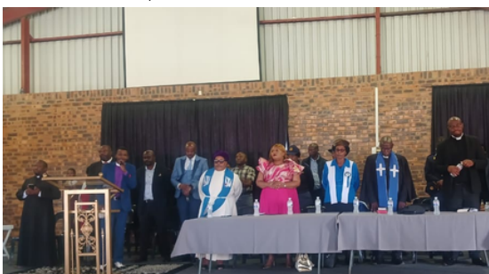
Interdenominational representation of clergy at the Clergy Awards ceremony