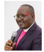
King Cetshwayo Bishop Bhekithemba Buthelezi