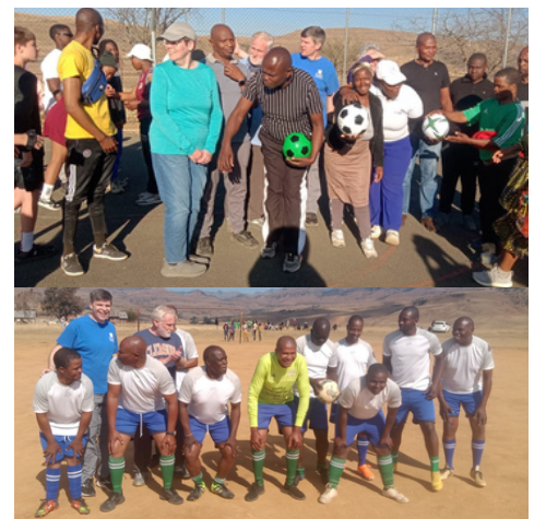
Pic 2-3: District Sports Day enhancing Social cohesion